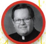
Cardinal Gerald C. Lacroix